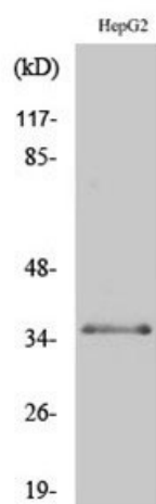
WB (WB) analysis of HepG2 cells using Phospho-C/EBP beta (T235) Polyclonal Antibody