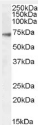
AF1456a (0.1 µg/ml) staining of Human Frontal Cortex lysate (35 µg protein in RIPA buffer). Primary incubation was 1 hour. Detected by chemiluminescence.