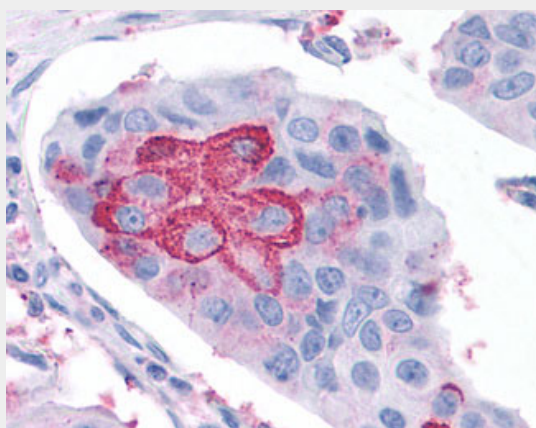
Anti-RORC / ROR Gamma antibody IHC of human Breast, Carcinoma.