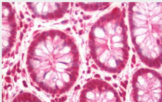
Human Colon: Formalin-Fixed, Paraffin-Embedded (FFPE)