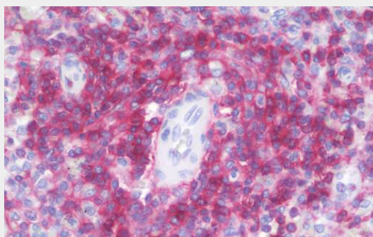
Anti-CD44 antibody IHC staining of human spleen.