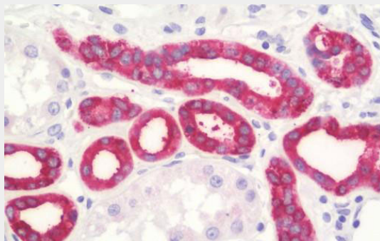
Anti-EMA / MUC1 antibody IHC staining of human kidney.