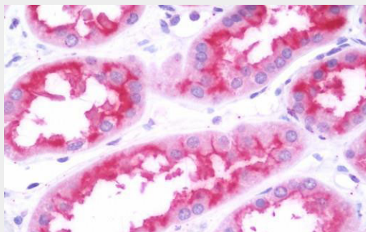
Anti-ANPEP / CD13 antibody IHC staining of human kidney.