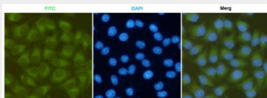
Immunofluorescent analysis of HeLa cells fixed by anhydrous methanol at -20°C and using FAK mouse mAb (dilution 1:200).