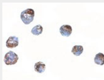
Immunocytochemistry of ZBED2 in A549 cells with ZBED2 antibody at 5 \mu g/mL.