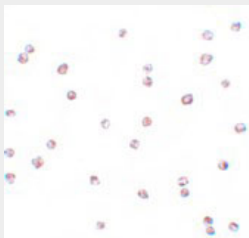
Immunocytochemistry of FOXO3 in A-20 cells with FOXO3 antibody at 4 µg/mL.