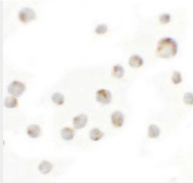
Immunocytochemistry of WDR5 in 293 cells with WDR5 antibody at 5 µg/mL.